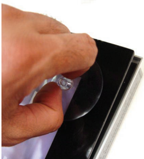
Magnetic peel out face